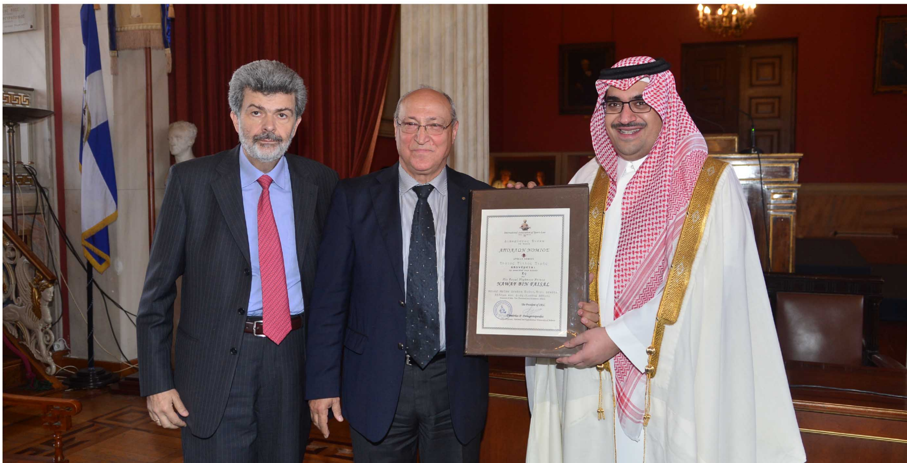
HRH Prince Nawaf Bin Faisal Bin Fahad Bin Abdul Aziz Al Saud