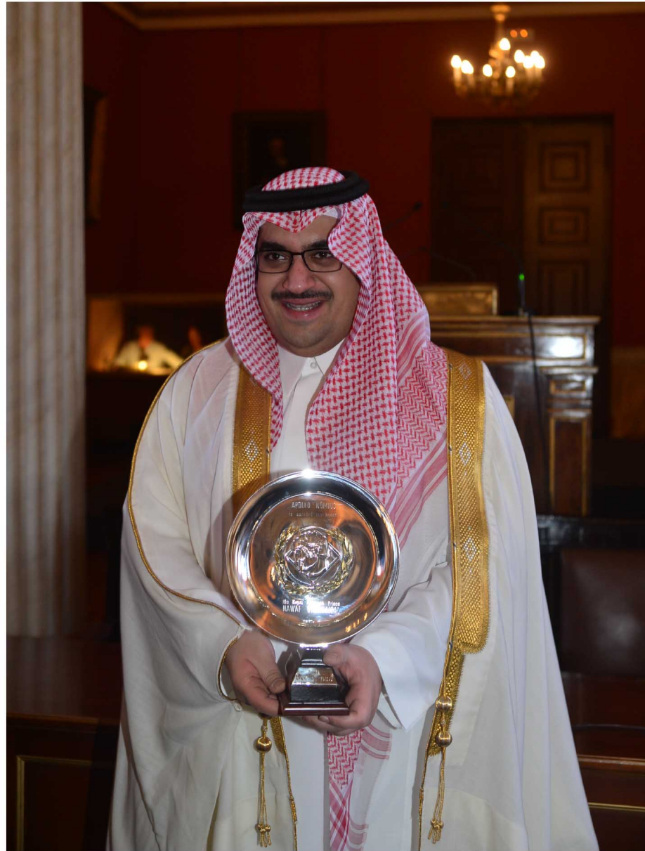
HRH Prince Nawaf bin Faisal receives the award “Apollo Nomius” for his achievements