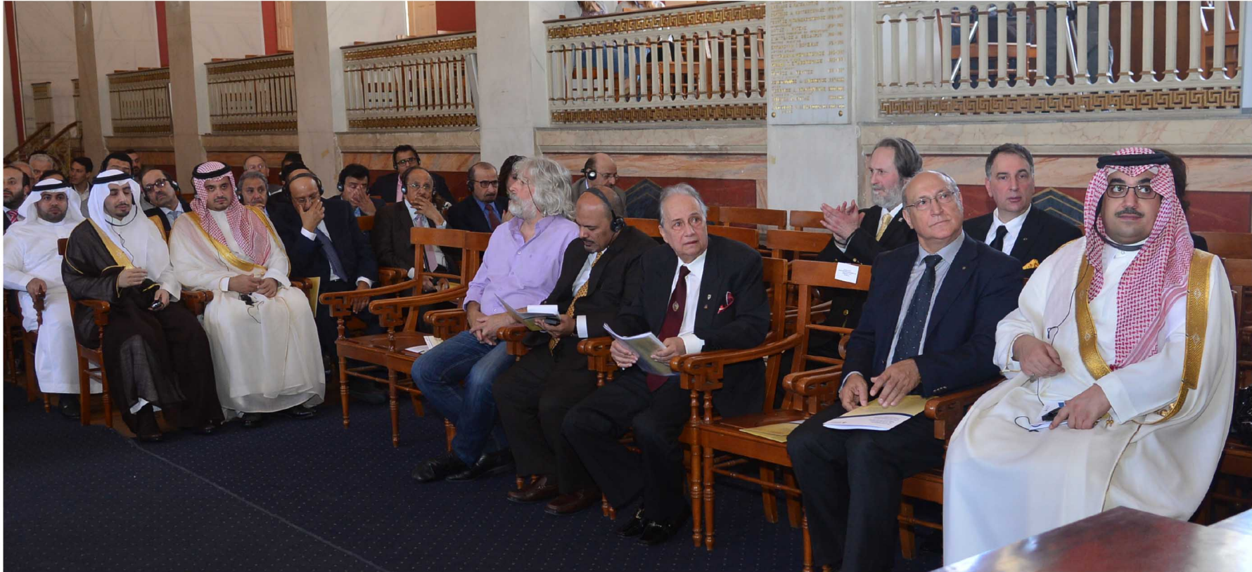
HRH Prince Nawaf Bin Faisal Bin Fahad Bin Abdul Aziz Al Saud