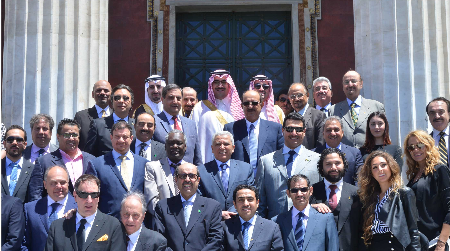
Some Arab Saudi Officials