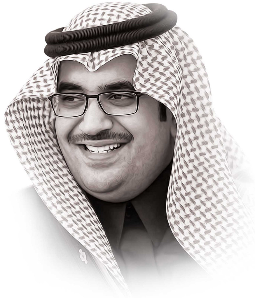
HRH Prince Nawaf Bin Faisal Bin Fahad Bin Abdul Aziz Al Saud