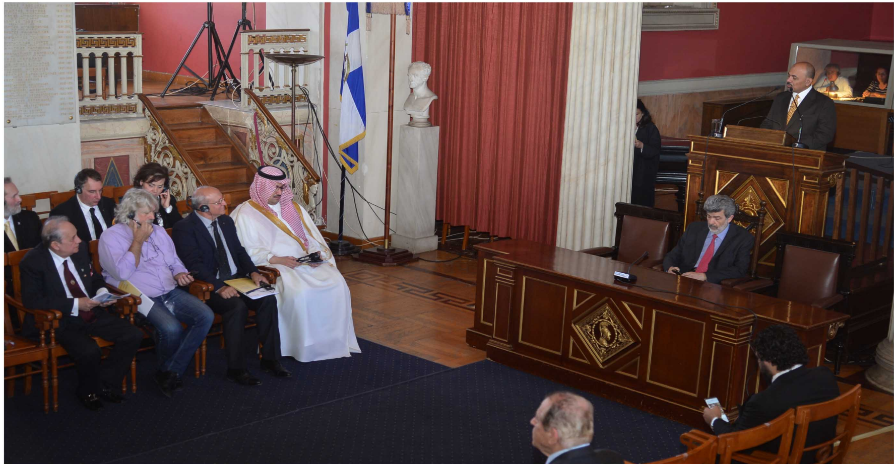
HRH Prince Nawaf Bin Faisal Bin Fahad Bin Abdul Aziz Al Saud