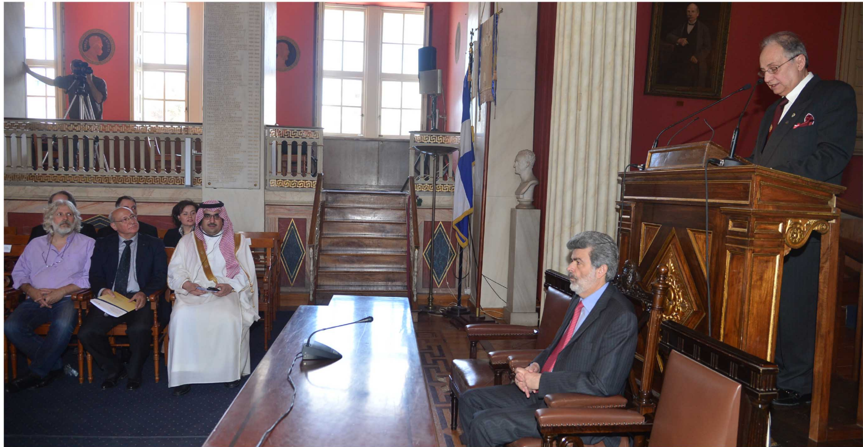
HRH Prince Nawaf Bin Faisal Bin Fahad Bin Abdul Aziz Al Saud