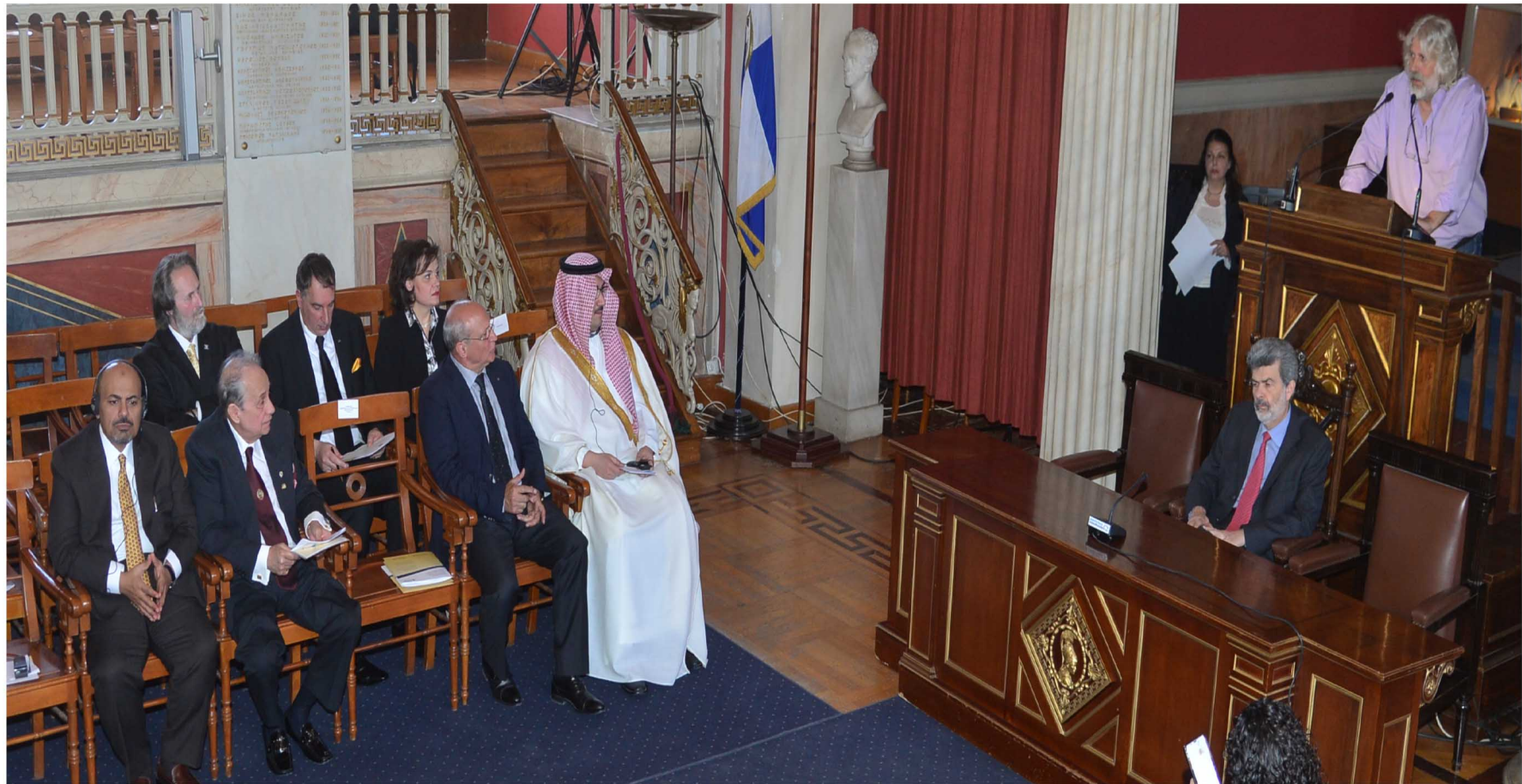
HRH Prince Nawaf Bin Faisal Bin Fahad Bin Abdul Aziz Al Saud